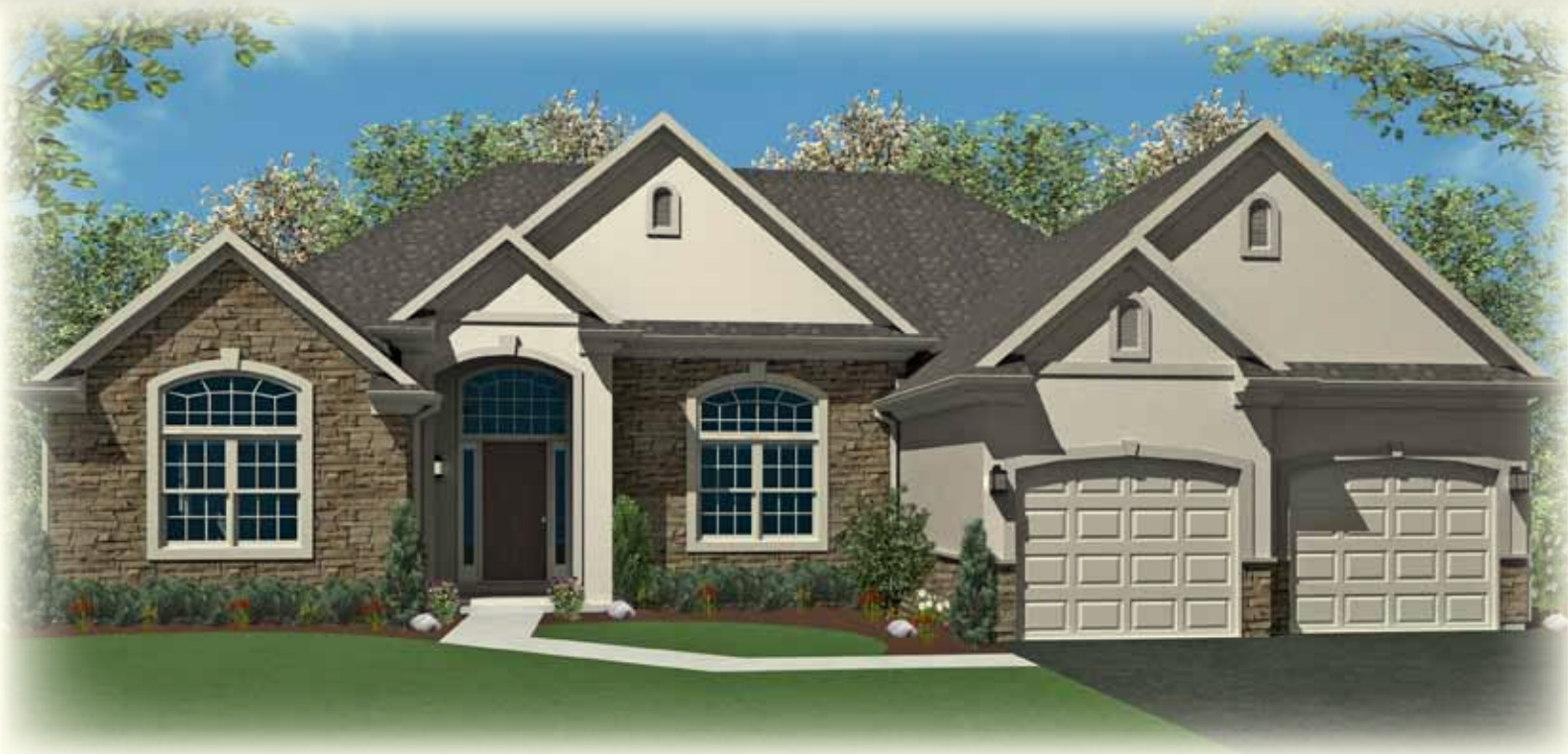
Elevation A AN-A-OR-0511

Shown with optional: 9' first floor ceilings, 12' ceilings in foyer, dining room, and great room, transom windows in study, and garage bump out