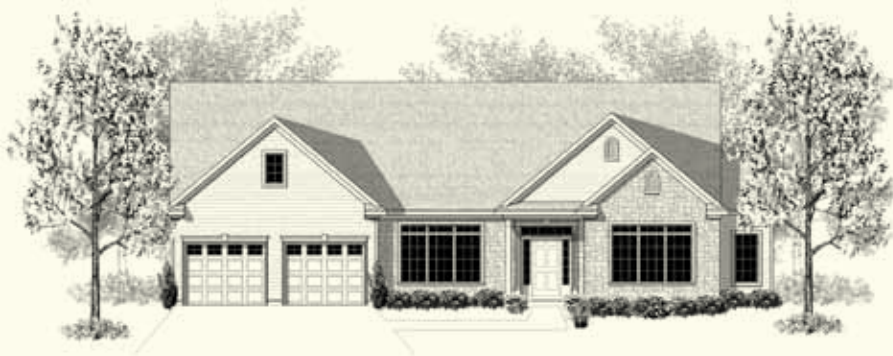
Elevation B AN-B-OR-0512

Shown with optional: 9' first floor ceilings, 12' ceilings in foyer, dining room, and great room, transom windows in study, and garage bump out