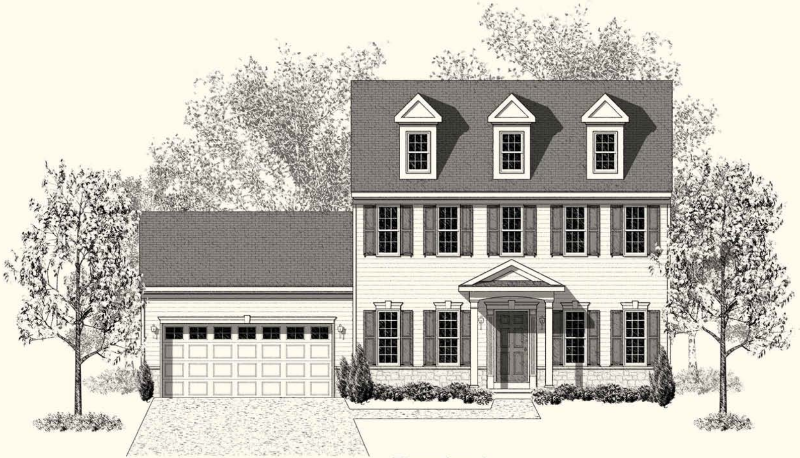
Elevation A DE-A-OR-0661

Shown with optional: 9 foot ceilings on first floor, front porch, arched porch beam, divided lite garage door, water table stone, 3 dormers, shutter dogs and hinges