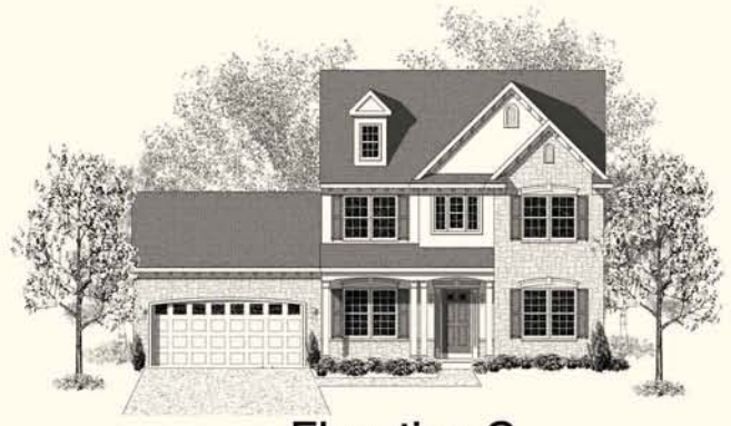
Elevation C DE-C-OR-0663

Shown with optional: 9 foot ceilings on first floor, arched porch beam, 2 dormers, board and batten shutters, shutter dogs and hinges, standing seam metal porch roof and returned eaves, perfection cedar siding ILO standard siding, and Newport garage door