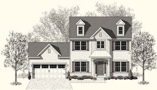
Elevation B DE-B-OR-0662

Shown with optional: 9 foot ceilings on first floor, front porch, arched porch beam, divided lite garage door, water table stone, 3 dormers, shutter dogs and hinges