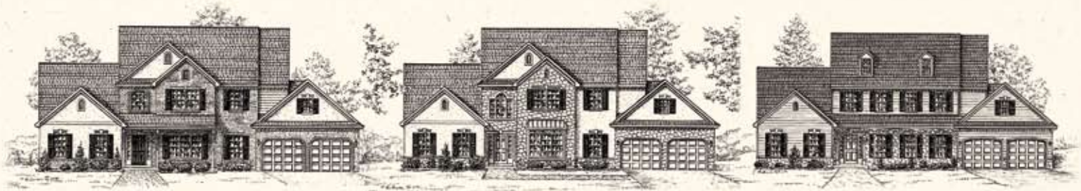
Elevation B KS-B-OR-0782

Shown with optional: Sideload garage, canamold trim over windows, custom porch posts and arches, hip roofs, window in den and 9' first floor ceilings