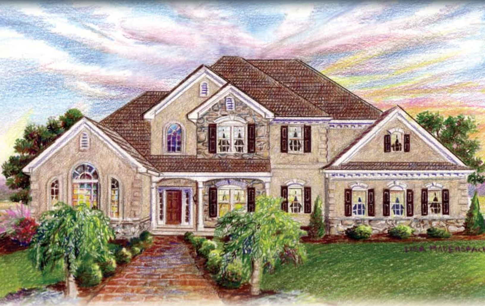
Elevation A KS-A-OR-0781

Shown with optional: Sideload garage, canamold trim over windows, custom porch posts and arches, hip roofs, window in den and 9' first floor ceilings