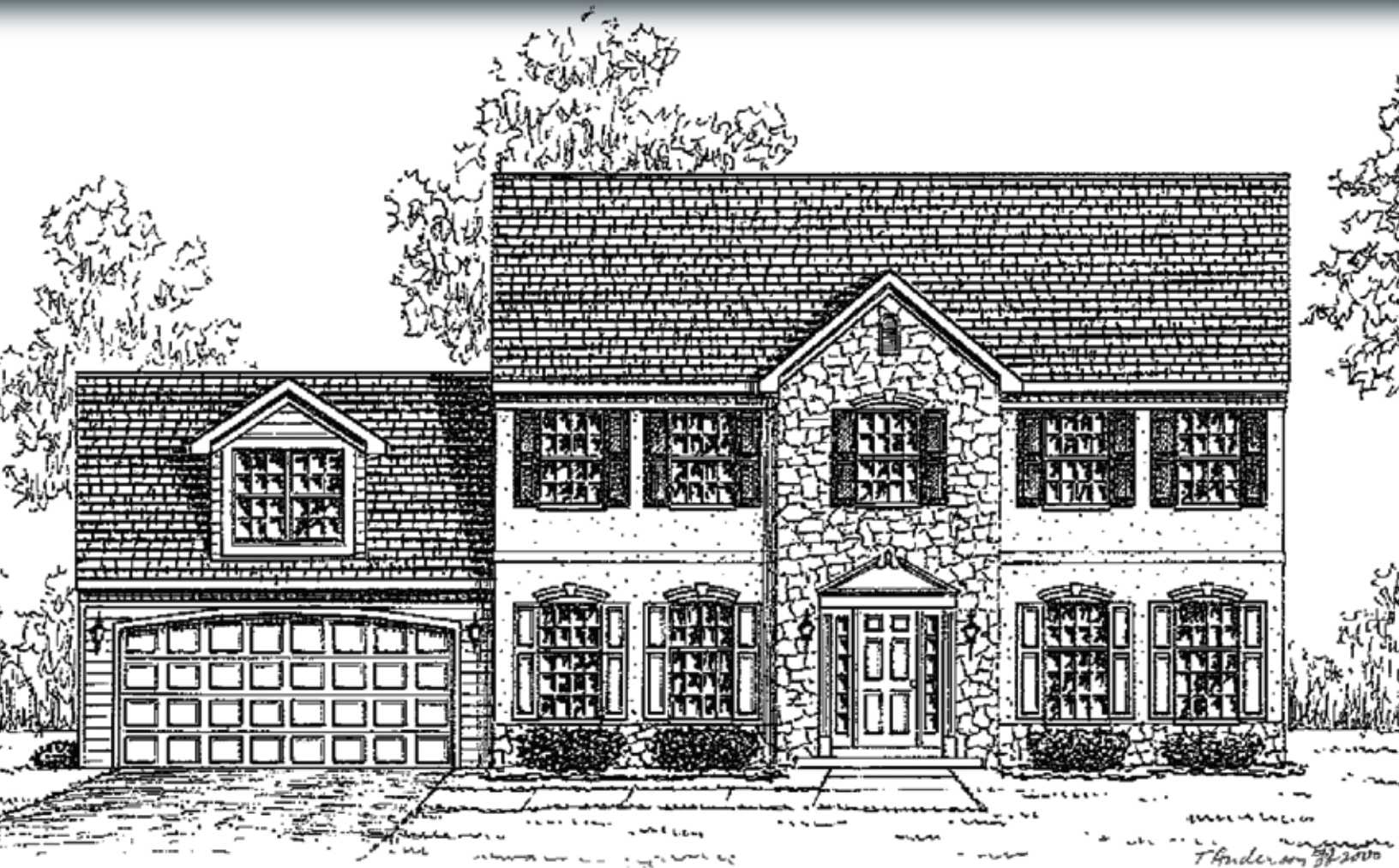
Elevation C OA-C-OR-0403

Shown with optional: Large dormer, arched garage door, sidelights and bonus room