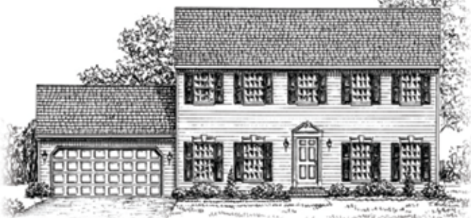
Elevation A OA-A-OR-0401

Shown with optional: Large dormer, arched garage door, sidelights and bonus room