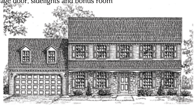
Elevation B OA-B-OR-0402

Shown with optional: Two small dormers and bonus room