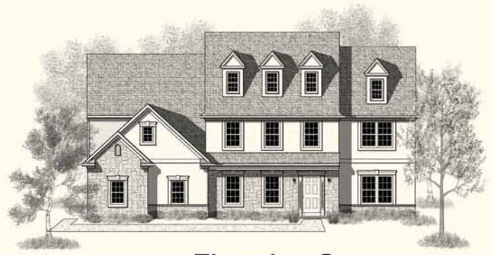
Elevation C SV-C-OR-1283

Shown with optional: 9 foot first floor ceilings, side load garage, 1 dormer