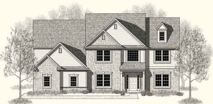
Elevation A SV-A-OR-1281

Shown with optional: 9 foot first floor ceilings, side load garage, garage and main house gable windows, 2 Walk-Out Bays w/ standing seam metal roofs, courtyard wall w/ light