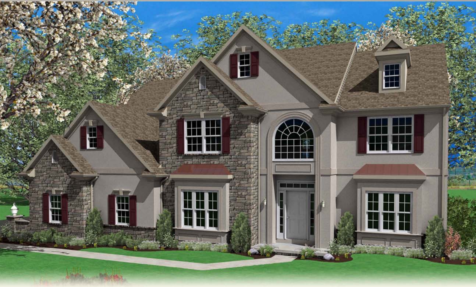
Elevation B SV-B-OR-1282

Shown with optional: 9 foot first floor ceilings, side load garage, garage and main house gable windows, 2 Walk-Out Bays w/ standing seam metal roofs, courtyard wall w/ light