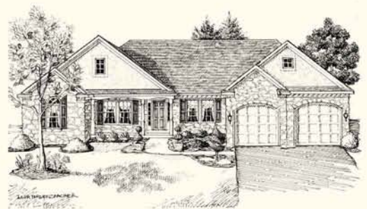
Elevation B SN-B-OR-0102

Shown with optional: Copper Roof, arched garage doors, window transoms.