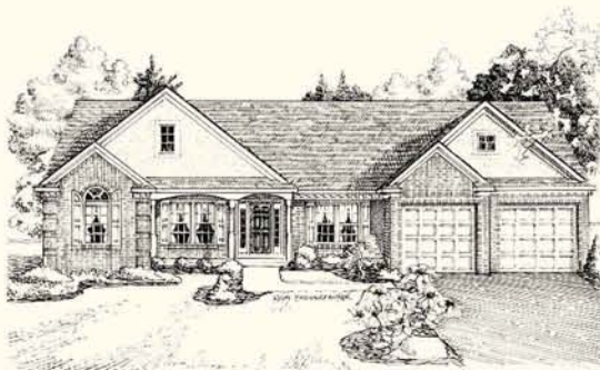
Elevation A SN-A-OR-0101

Shown with optional: Copper Roof, arched garage doors, window transoms.