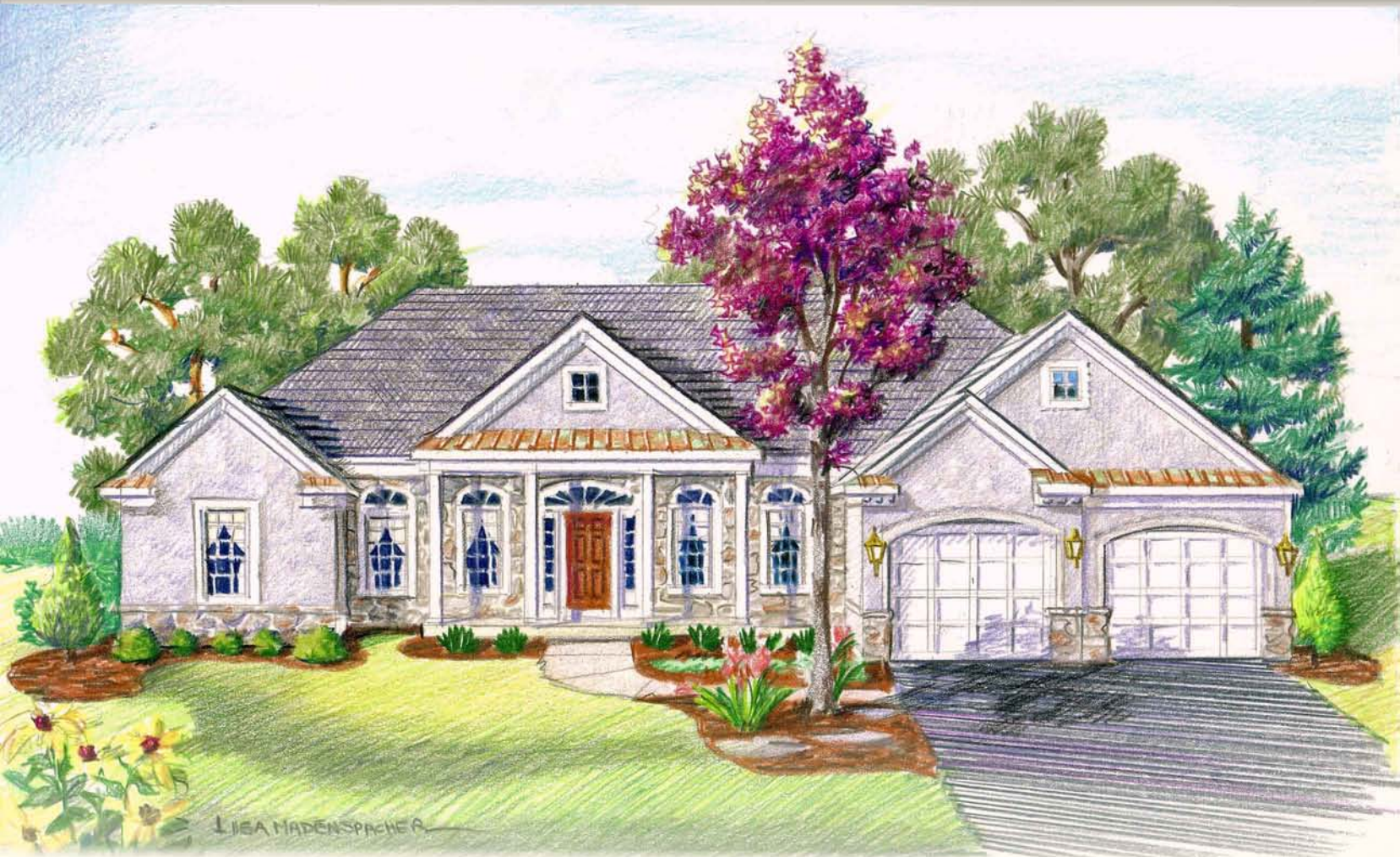
Elevation C SN-C-OR-0103

Shown with optional: Copper Roof, arched garage doors, window transoms.