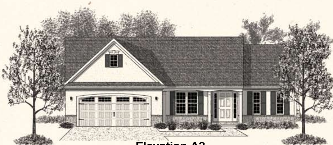
Elevation A3 SU-A-OR-1491

Shown with optional: Side load garage, garage gable window, 2 dormers, 10 foot ceiling height in foyer and dining room, arch porch beam