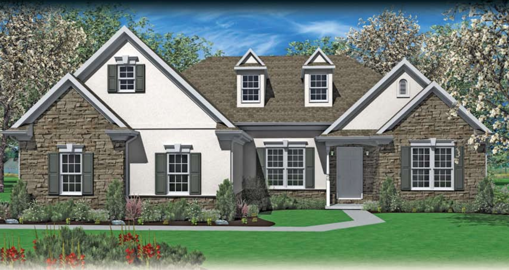
Elevation B3 SU-B-OR-1492

Shown with optional: Side load garage, garage gable window, 2 dormers, 10 foot ceiling height in foyer and dining room, arch porch beam